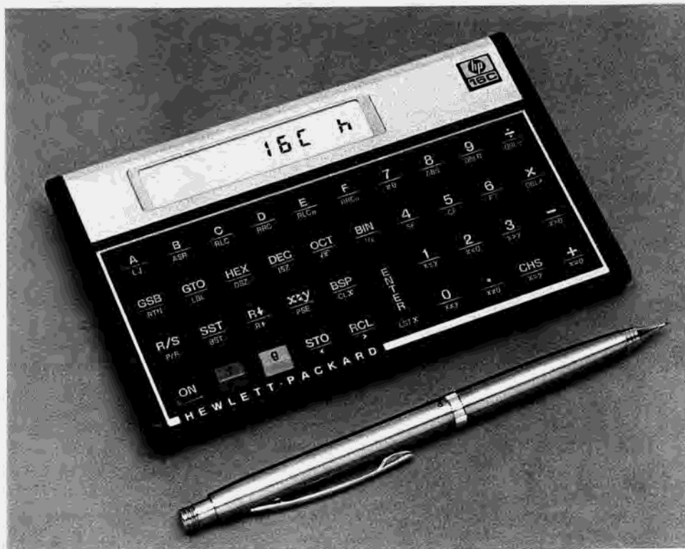
Fig. 1. The HP-16C Programmable Calculator is designed for computer science and digital electronics applications. Besides the normal four-function calculator features, it has a number of capabilities for setting number bases and word sizes, performing Boolean operations, and manipulating bits.

In addition to the four-register RPN stack, 203 bytes of user memory are available for storing program steps and use as storage registers. When the program memory is cleared, all 203 bytes are allocated to storage registers. The number of storage registers available depends on the selected word